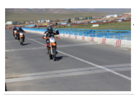
1 - - Ulaanbaatar - Arrive Ulaanbaatar. Overnight hotel.