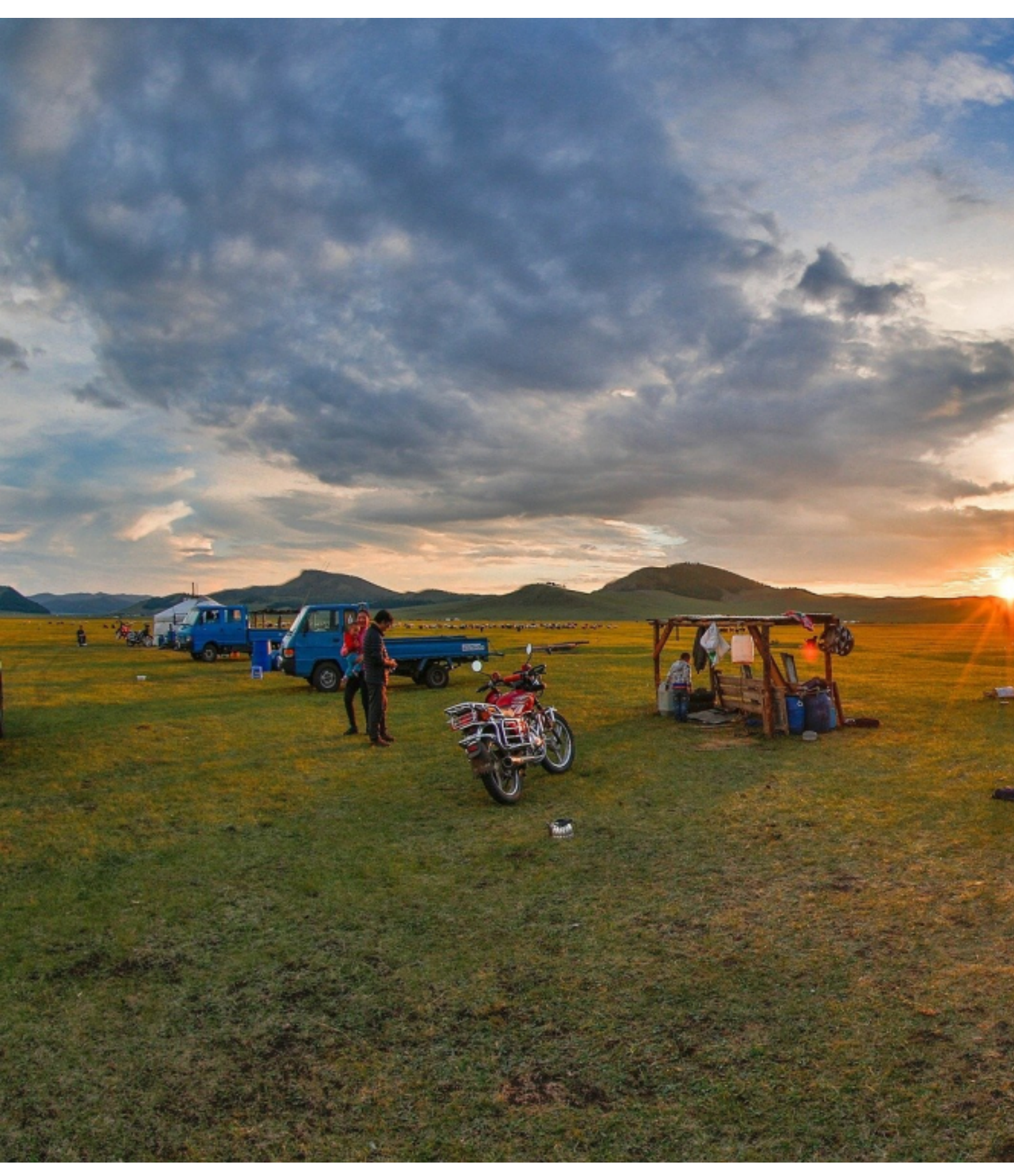
Motorcycle Enduro off Road tour Mongolia White Lake