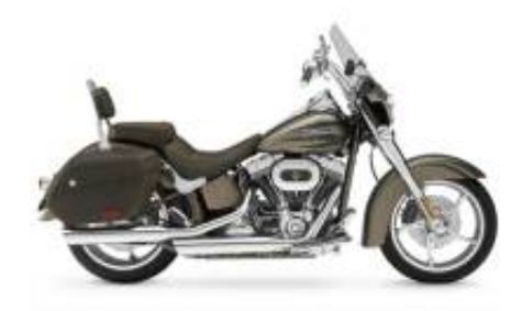
Softail + $932.54