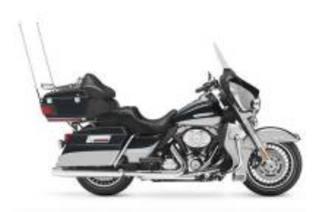
Road Glide Ultra Grand Touring Class + $932.54