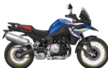
F 850 GS + $270.85