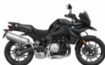
F 750 GS + $0.00