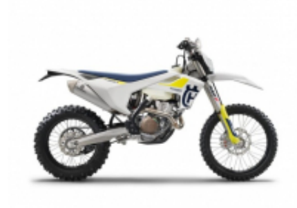
TE 350 + $0.00