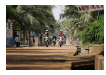
3 - Ouidah - Ouidah - 120 km