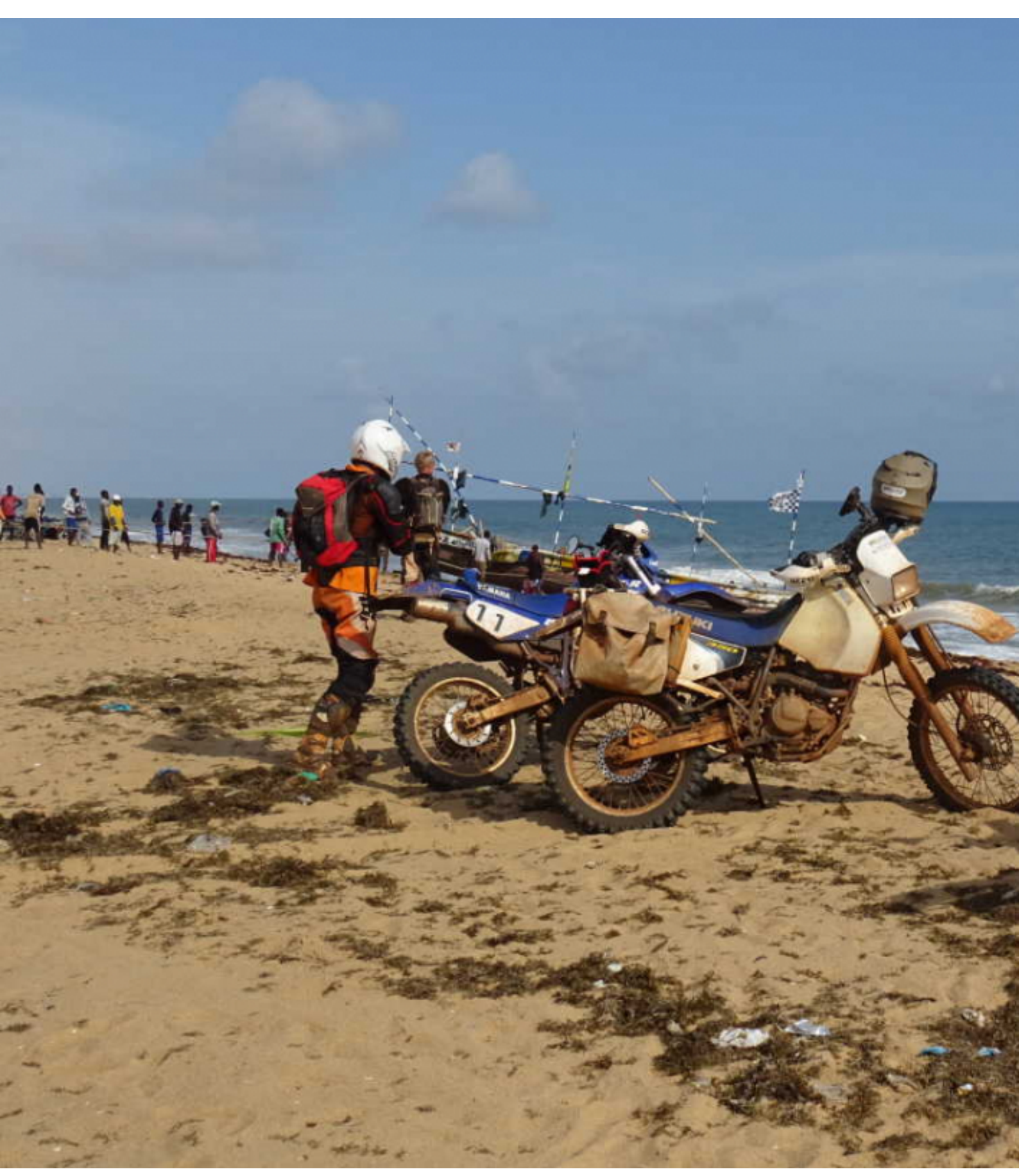
Motorcycle Enduro off Road tour Ivory Coast Enduro