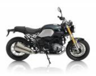
R Nine T Pure + $164.39