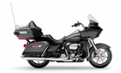
Road Glide Grand Touring Class + $0.00