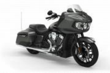
Challenger Street Touring Class + $0.00