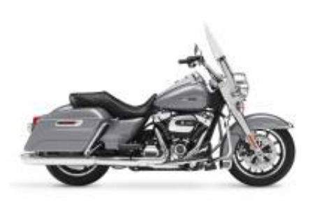
Road King (Gen) Cruiser Touring Class + $0.00