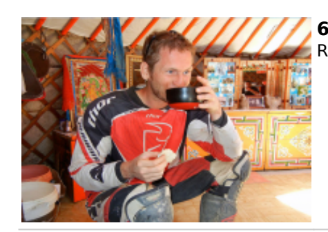
6 - Dundburd - Jargalant - Ride to Batnorov and spend the evening with a nomadic family.