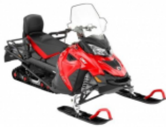
Lynx Adventure LX 600 ACE 2019 + $0.00