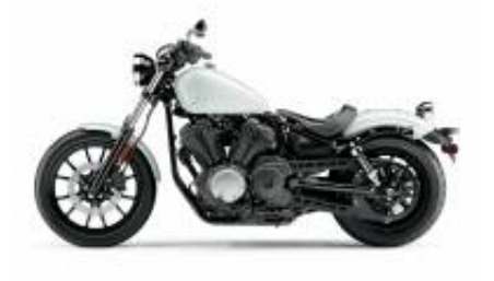
XV 950 Bolt + $700.00