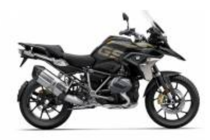
R 1250 GS LC + $132.26