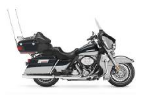
Road Glide Ultra Grand Touring Class + $700.00