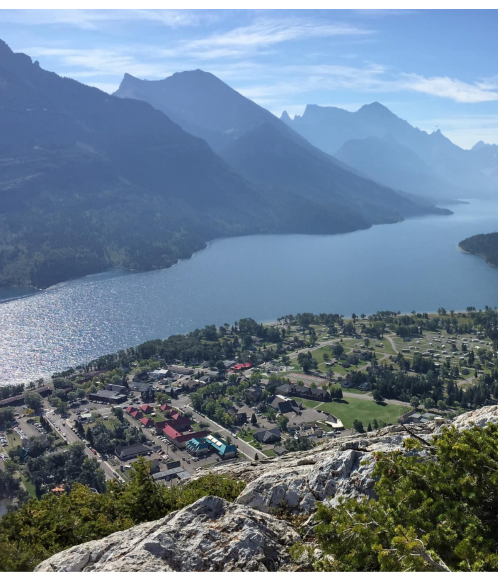
8-day Self-guided Motorcycle Tour of Canada's Chinook Country.