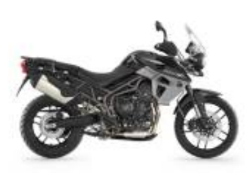
Tiger 800 XRX + $700.00