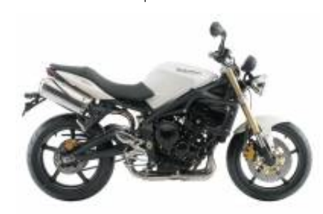
Street Triple 675 + $700.00