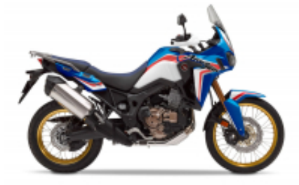
Africa Twin CRF 1000 L + $1,200.00