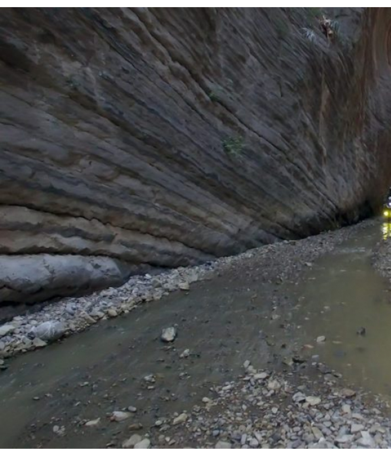
Motorcycle Enduro off Road tour Mexico Adventure