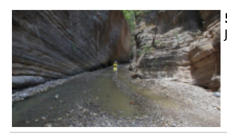
5 - El Jabalí - Peña de Bernal - 112 Jabali - Peña de Bernal