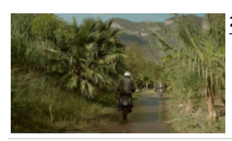
2 - San Juan Teotihuacán - La Gloria - 258 Teotihuacán - La Gloria