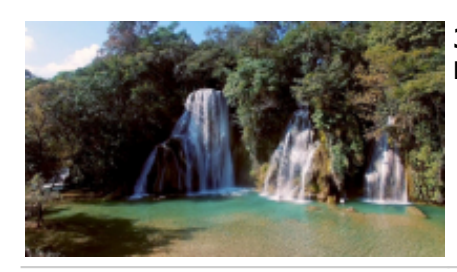
3 - La Gloria - Presa Zimapán - 102 La Gloria - Zimapán