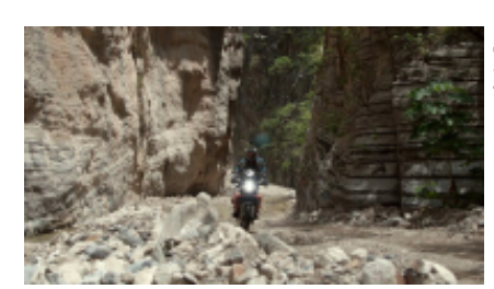
4 - Presa Zimapán - El Jabalí - 98 Zimapán - Mina Carrizal - Jabalí