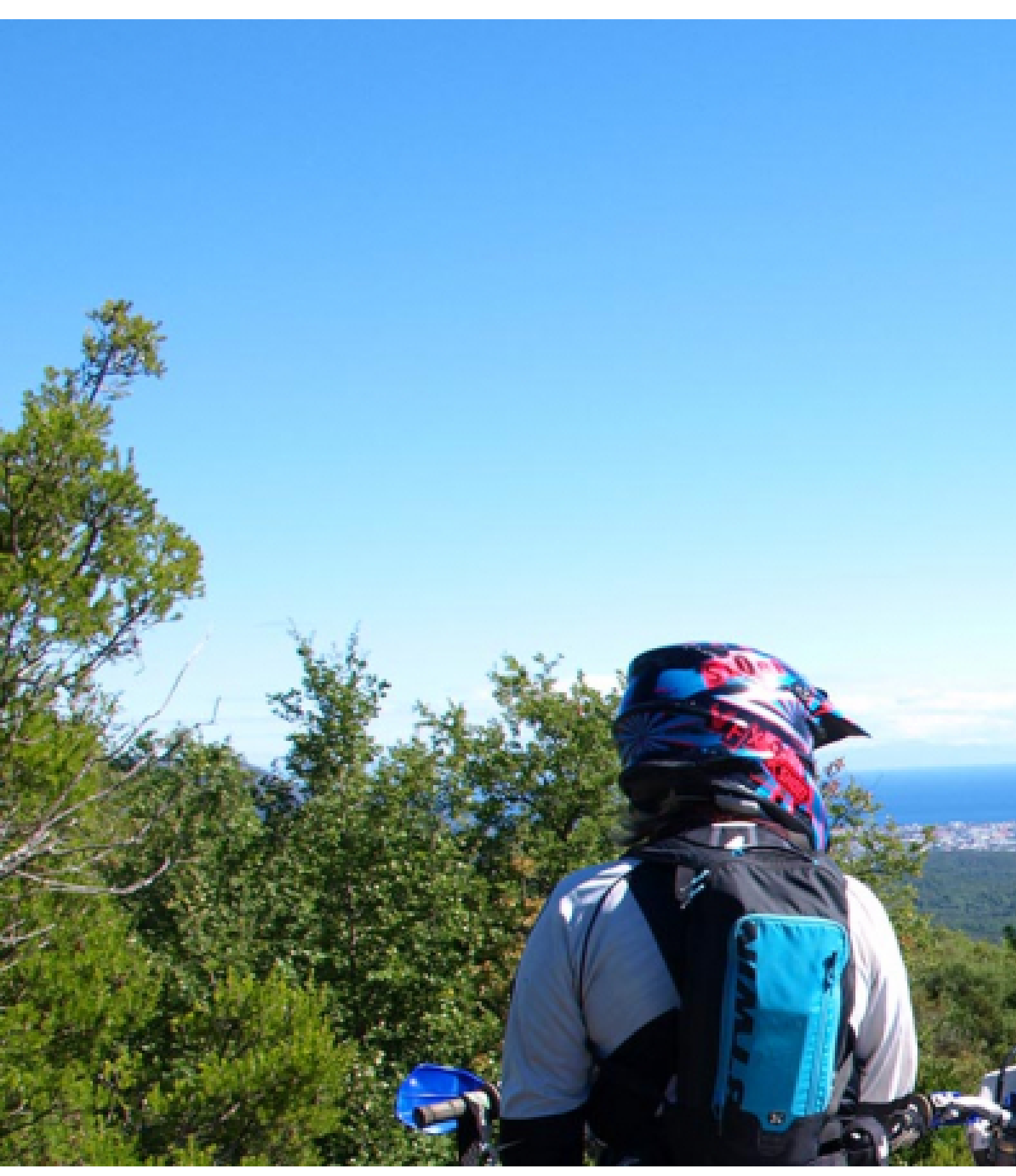
Motorcycle Enduro off Road tour Liguria Itali