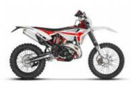
RR 300 2T + $0.00