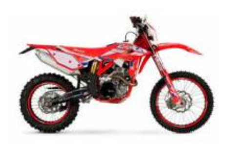
RR 430 4T + $0.00