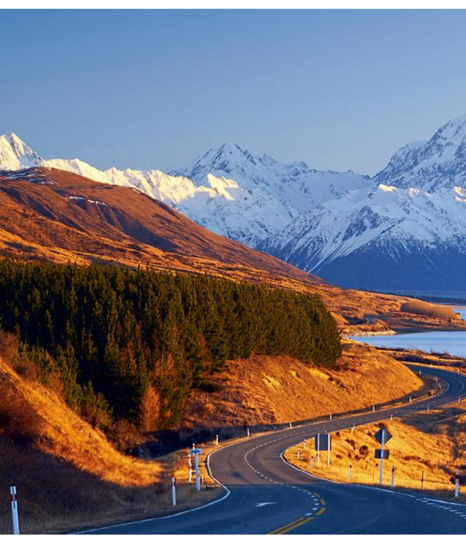
18-day Fully Guided Motorcycle Tour of New Zealand's North Island