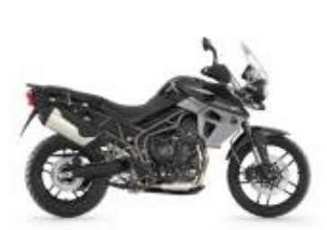
Tiger 800 XRX + $600.00