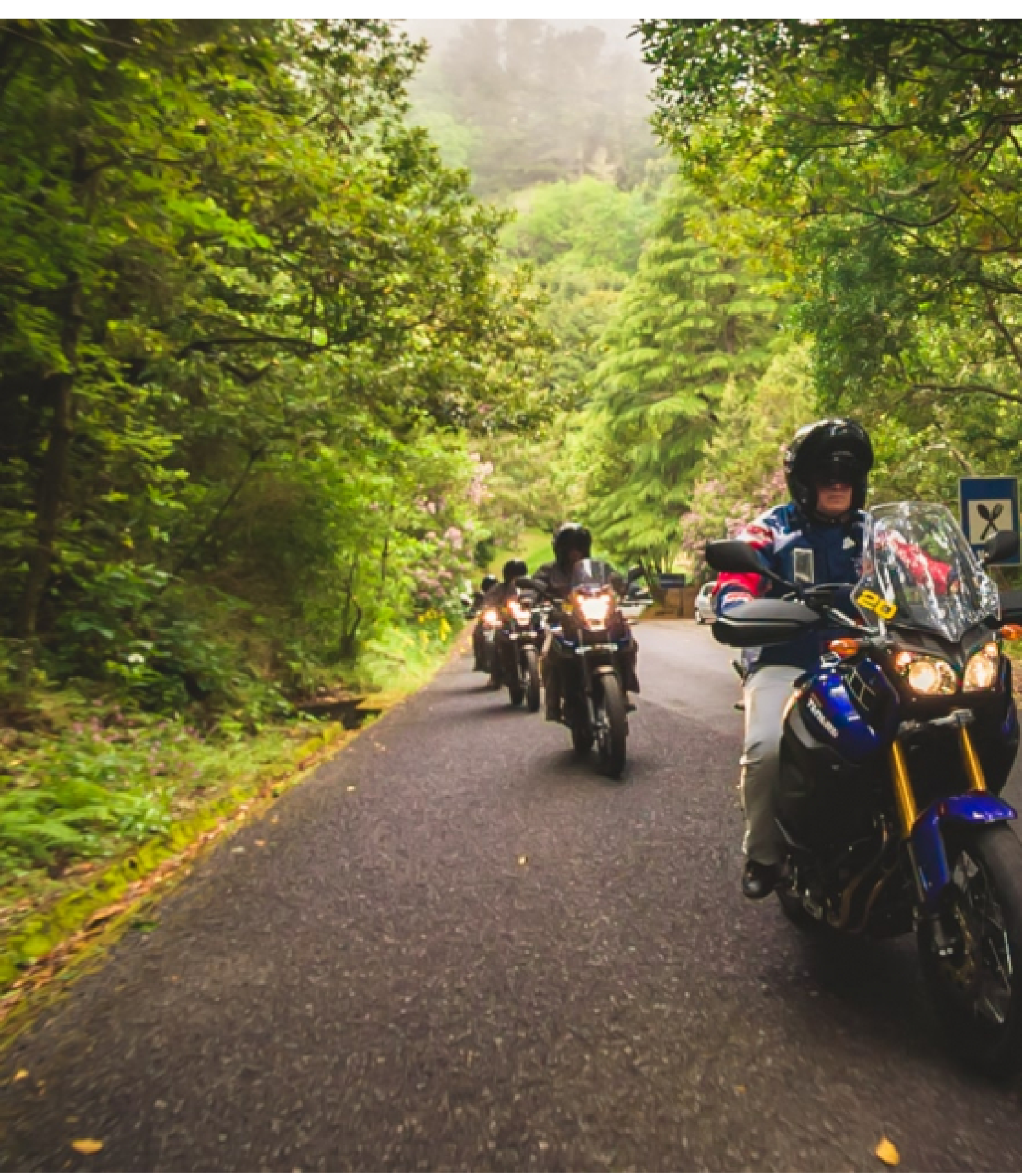
Motorcycle dual-purpose and Adventure, Madeira Pearl of Atlantic