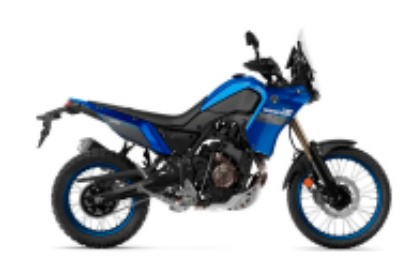
Tenere 700 + $65.85