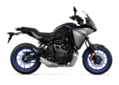
Tracer 700 + $54.88