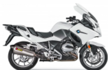
R 1200 RT + $418.58