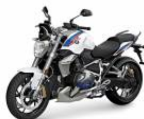
R 1250 R + $418.58