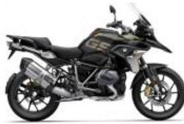
R 1250 GS LC + $190.00