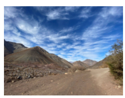
3 - Pisco Elqui - Santiago - 310 Return to Santiago by Route 5 with arrests in Huentelauquén, Canela wind farm, Los Vilos or Pichidangui