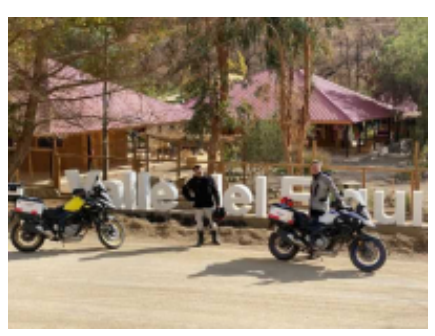
1 - Santiago - Combarbalá - 240 Departure from Santiago 8:30 Arrival in Combarbalá approx 16:30 Accommodation in Combarbala