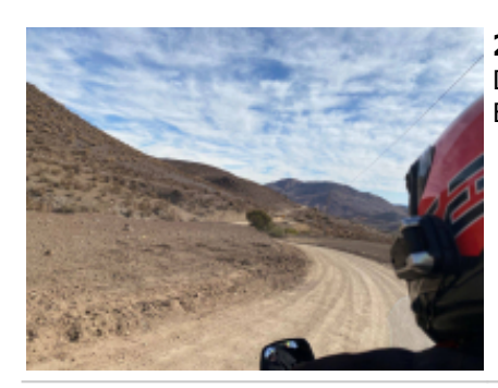
2 - Combarbalá - Pisco Elqui - 220 Departure to Pisco Elqui at 9:00 Arrival approx at 16:30 Acomodation in Pisoc Elqui