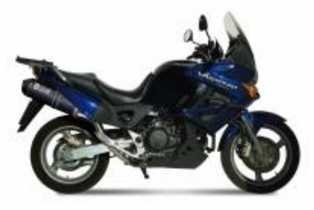
XL Varadero 1000 + $0.00