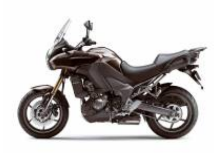
Versys 1000 + $0.00