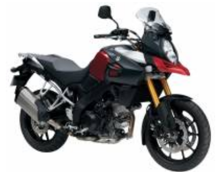
DL 1000 V Strom + $0.00