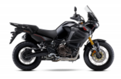
Super Tenere 1200 + $0.00