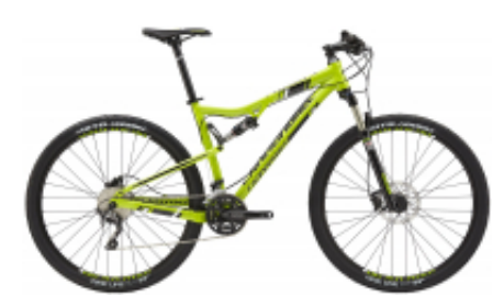
29" Rush 2 + $35.39