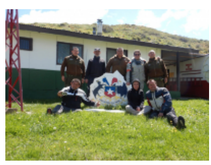
17 - Punta Arenas - Punta Arenas - RETURN