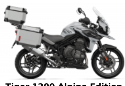
Tiger 1200 Alpine Edition + $2,255.14