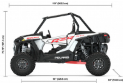
RZR 1000 XP + $0.00