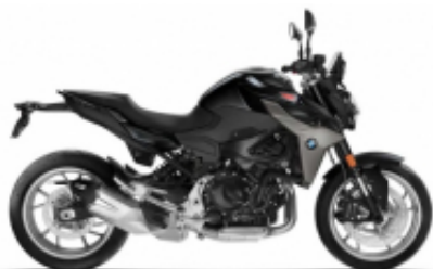
F 900 R + $52.09