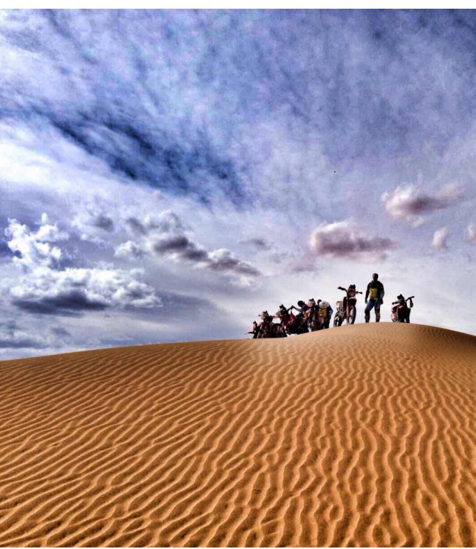
Adventure Motorcycle in Morocco: Atlas & Sahara in KTM