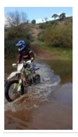
6 - Faro - Faro - 0 transfer to Faro airport.