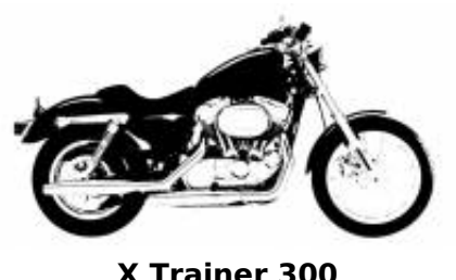
X Trainer 300 + $551.08