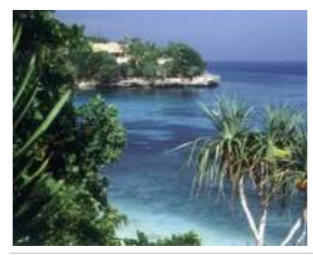
3 - Pekutatan - Negara -