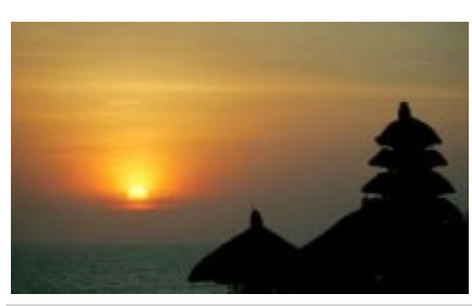
2 - NUSA DUA - Pekutatan -