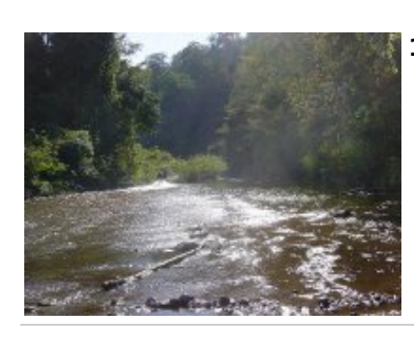
1 - - Nusa Dua -