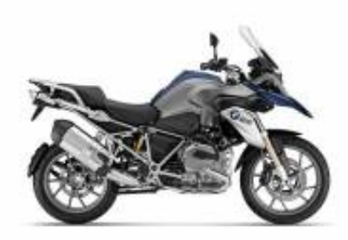
R 1200 GS + $272.39