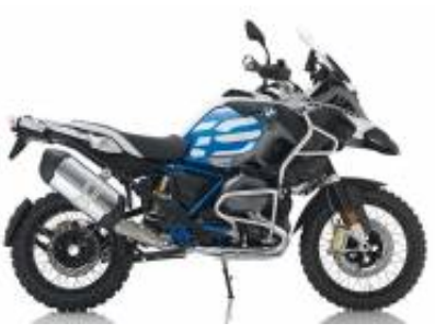
R 1200 GS Adv + $272.39