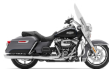
Road King Street Classic Class + $627.88