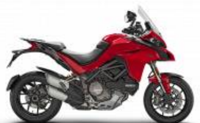
Multistrada 1260 + $520.92