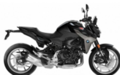
F 900 R + $0.00