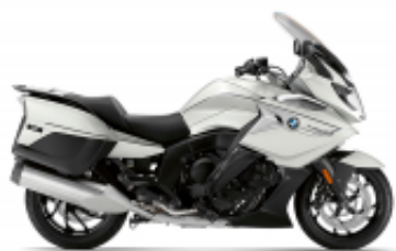
K 1600 GTL + $627.88