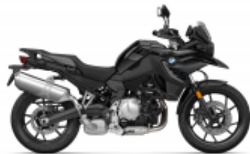
F 750 GS + $790.26