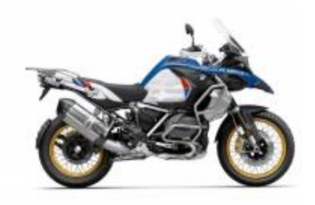
R 1250 GS Adv LC + $199.07