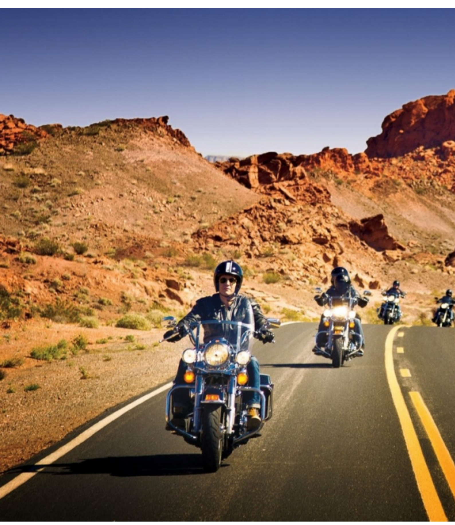
Gran Turismo or Harley Motorbike Tour Half Route 66, Albuquerque to Los Angeles with a guide