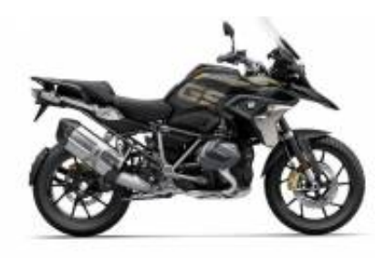
R 1250 GS LC + $265.42