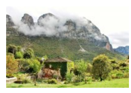
3 - Ioánnina - Papingo - Zagorohoria

Greece. It was set up by the sculptor Pavlos Vrellis in February 1983 and is the best-known wax museum in Greece. The museum hosts 150 wax models in 37 themes, inspired by various events from Greek history.