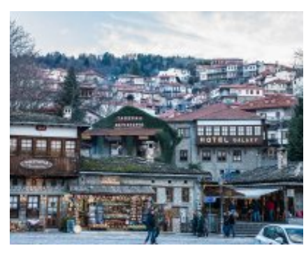
5 - Ioánnina - Metsovo - Metsovo

Admire the high, impressive mountain ranges, the densely forested slopes and the amazing natural landscapes. The entire motorcycle tour is a truly magnificent unspoiled paradise that will definitely stimulate your senses and leave you craving for more!