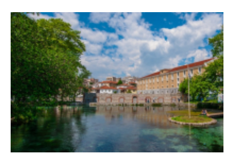
1 - GS Traveler Moto Rentals - Drama -Athens to Drama

Get acquainted with your BMW rental motorbike at the tour company's office. After a short briefing of the tour & itinerary, take off on your BMWs. All destinations and points of interest will be uploaded to the GPS that comes with the motorcycle.