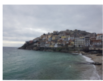
5 - Kavala - Salònica -

Examine Imaret, an impressive building erected by Mehmet Ali (1769 to 1849) as a donation to its native town. It is situated on the western side of the Old City, in Panayia. It was beautifully renovated by the Misirians, a family of tobacco traders. The building complex was a "kulliye"- a religious schoolmaybe the last of the Ottoman Empire offering social and educational services.