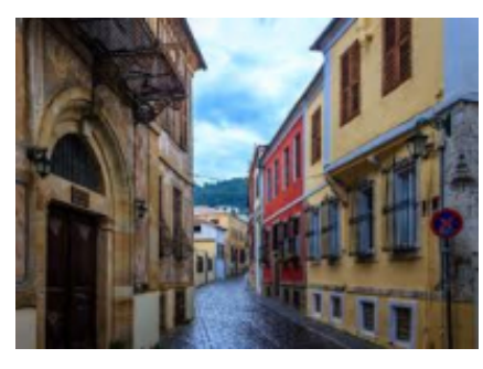
4 - Xanthi - Kavala - Xanthi to Kavala city

Being the natural border between the districts of Kavala and Xanthi, the Nestos runs a long way of sheer gorgeousness consisting of rich forests, rare wetlands and imposing geological formations. A breath of life and home to a very delicate habitat, it is one of the top 5 biotopes in Europe.