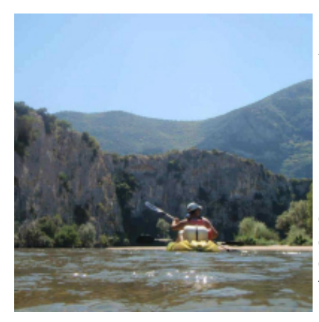
3 - Xanthi - Toxotes - Xanthi and kayak in Nestos river

Proceed to the region of Drama which is one of the finest Greek regions for wine production. Nico Lazaridi estate is one of the finest examples where you can see the vinification process, taste the eclectic wines and also visit the art gallery situated inside the winery. All the labels of their wines are actual paintings that can be viewed in their gallery.