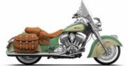
Chief Vintage + $390.00