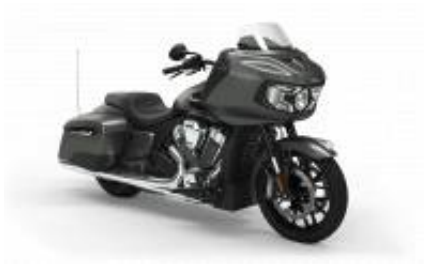
Challenger Street Touring Class + $390.00