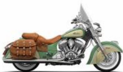
Chief Vintage + $390.00