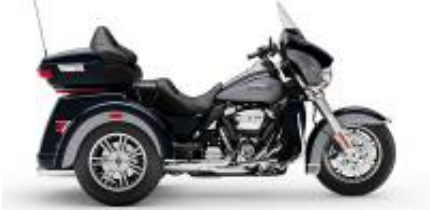
Trike Tri Glide (Gen) + $1,695.00