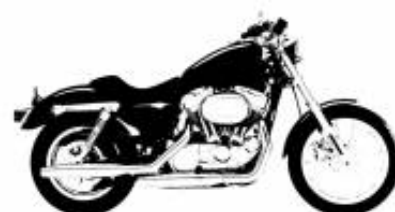
Road King Street Touring Class + $260.00