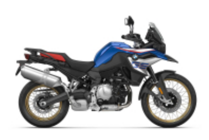
F 850 GS + £342.71