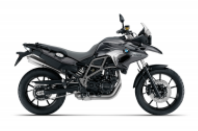
F 700 GS + £299.87