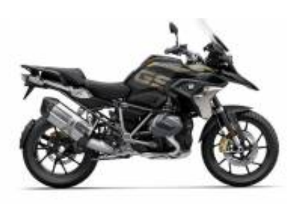
R 1250 GS LC + £428.39