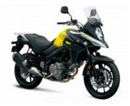
DL 650 V Strom + $0.00