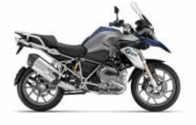
R 1200 GS + $1,350.00