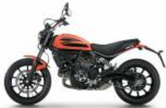
Scrambler Sixty2 400 + $296.92