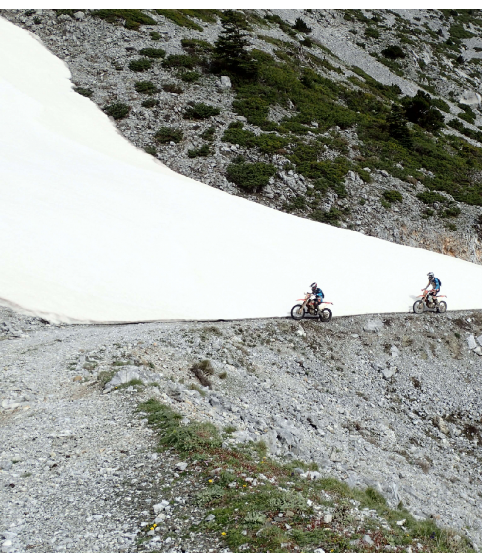
Motorcycle Enduro off Road tour Greece, Athens