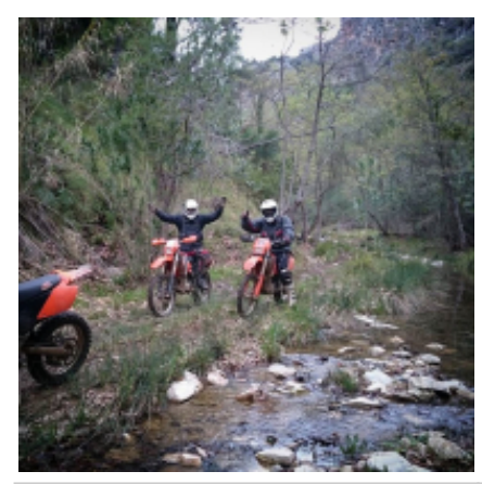
6 - Atenes - Atenes - 0

Today is the last day, depending on what time our flight leaves back home, they will take us to the airport