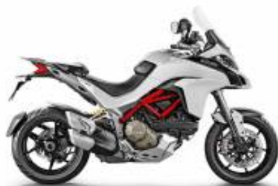
Multistrada 1260 V4 + R$ 0,00