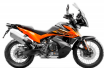
890 Adventure + R$ 0,00