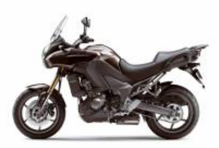
Versys 1000 + $0.00