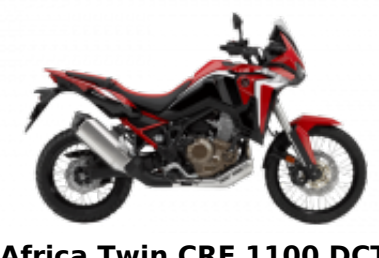
Africa Twin CRF 1100 DCT + $0.00