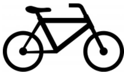
La meva bicicleta