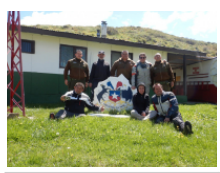
17 - Punta Arenas - Punta Arenas - RETURN