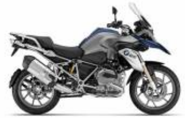
R 1200 GS + $442.37