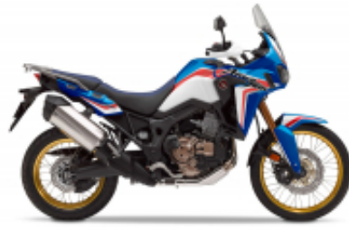
Africa Twin CRF 1000 L + $442.37