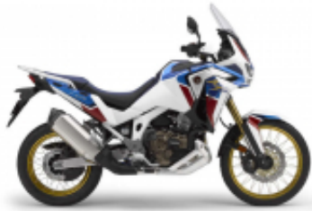
CRF1000L Africa Twin Adventure Sports + $442.37