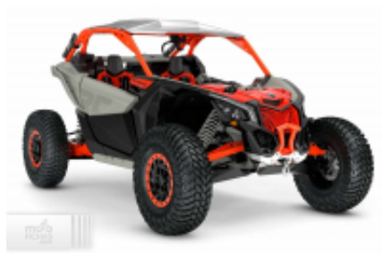
Maverick X3 + $0.00