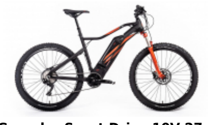
Graveler Sport Drive 10V 27,5 20.ETM.30 + $49.60