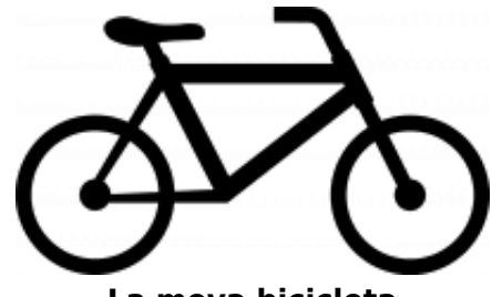
La meva bicicleta + $0.00