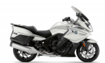
K 1600 GTL + $0.00