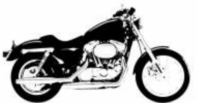
R 18 Transcontinental + $0.00