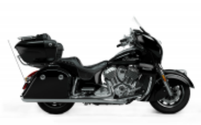
Roadmaster 1890 Grand Touring Class + $0.00